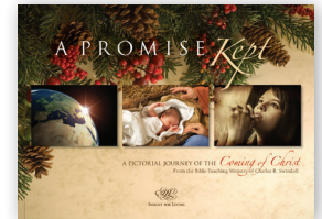
A Promise Kept: A Pictorial Journey of the Coming of Christ by Insight for Living softcover book