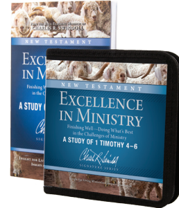
Excellence in Ministry: Finishing Well—Doing What's Best in the Challenges of Ministry by Charles R. Swindoll and Insight for Living Ministries CD series and softcover Bible Companion

For these and related resources, visit www.insightworld.org/store or call USA 1-800-772-8888 • AUSTRALIA +61 3 9762 6613 • CANADA 1-800-663-7639 • UK +44 1306 640156