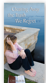
Clearing Away the Trash We Regret by Charles R. Swindoll booklet

For related resources, please call: USA 1-800-772-8888 AUSTRALIA 1 300 467 444 CANADA 1-800-663-7639 UK 0800 915 9364 Or visit www.insight.org or www.insightworld.org