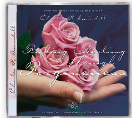
Finding Healing through Forgiveness by Charles R. Swindoll CD set