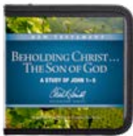
Beholding Christ . . . The Son of God: A Study of John 1–5 by Charles R. Swindoll CD series