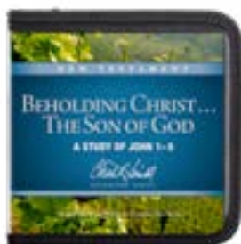
Beholding Christ . . . The Son of God: A Study of John 1–5 by Charles R. Swindoll CD series