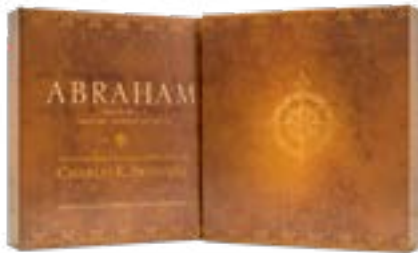
Abraham: One Nomad's Amazing Journey of Faith by Charles R. Swindoll Classic CD series