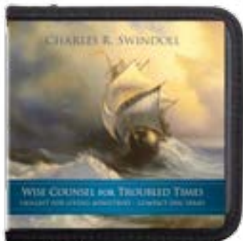
Wise Counsel for Troubled Times by Charles R. Swindoll CD series