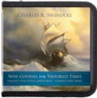
Wise Counsel for Troubled Times by Charles R. Swindoll CD series