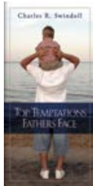
Top Temptations Fathers Face by Charles R. Swindoll booklet