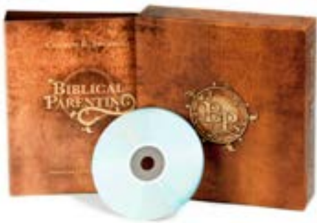
Biblical Parenting by Charles R. Swindoll CD series