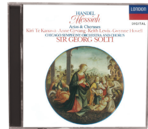
Messiah: Arias & Choruses by Chicago Symphony and Chorus CD

For these and related resources, visit www.insightworld.org/store or call USA 1-800-772-8888 • AUSTRALIA +61 3 9762 6613 • CANADA 1-800-663-7639 • UK +44 1306 640156